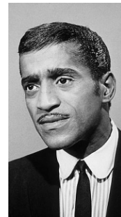
Sammy Davis Jr

dough in these days to see Sammy Davis Jr at the Prince of Wales theatre. Billed as the world's greatest entertainer he certainly lived up to the title. At one point in the show he appeared in a straw boater presented to his father by