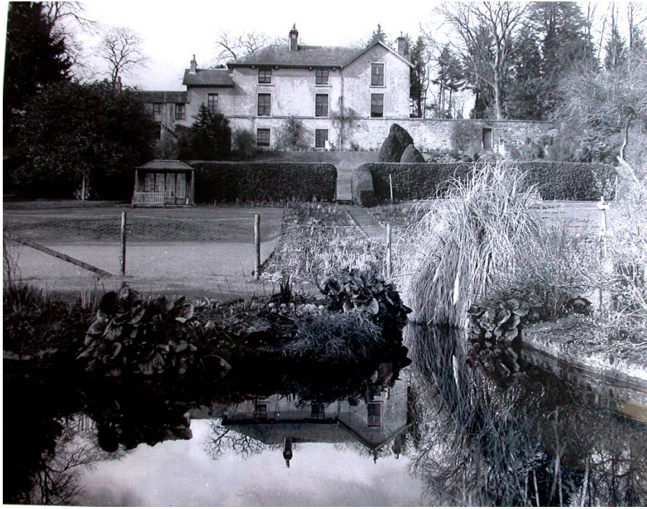
Fig. 2. Lawpark, St. Andrews

as “Law Milnhead Acre” (now called “Lawpark”) located on the south side of South Street, St Andrews. (Fig.2) 14