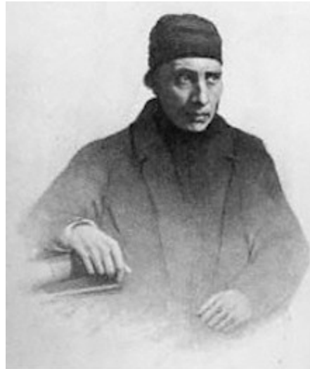
Fig.5. Professor John Goodsir, Painting by George Aikman c.1854

Besides his regular lectures, Goodsir gave courses of comparative Anatomy in summers for many years. This resulted in increased attendance in his class of Anatomy during the regular academic year. Thus all his efforts and energies were devoted to anatomy and his system of teaching was regarded as the best ever regulated the anatomical department of any British university or medical school. 24