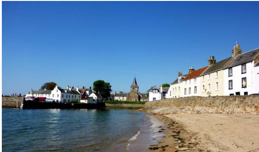
Fig.9. Coastline of Anstruther, Fife, Scotland