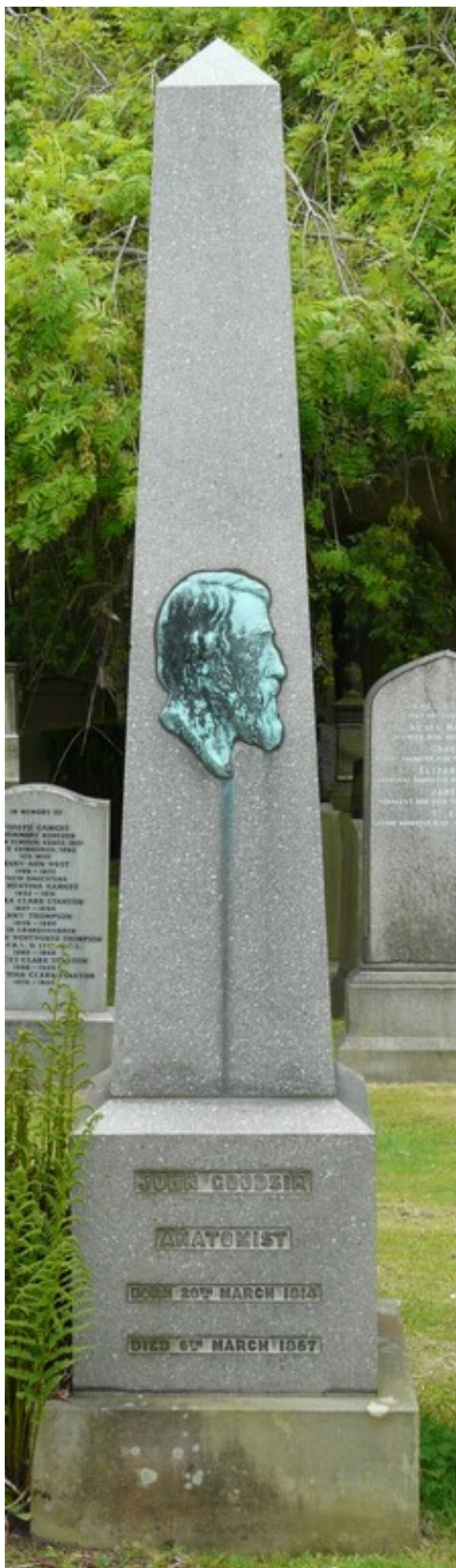
Fig. 8. Grave of Professor John Goodsir, Dean Cemetery, Edinburgh, 19 November 2013