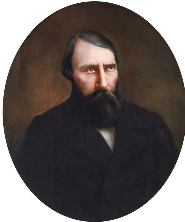
Fig.1. Portrait of Professor John Goodsir, ‘Conservator of the Museum of the Royal College of Surgeons of Edinburgh’

“On Monday, the 11 th inst., were deposited in the Dean Cemetery, of Edinburgh, the mortal remains of perhaps the most accomplished anatomist and the most successful teacher of his time. This language cannot be deemed too strong for John Goodsir. By the distinguished colleagues who were the pall-bearers at the mournful ceremony, by the numerous private friends, and by the 200 pupils of the present and past years; who followed their associate and master to his final resting place, it will be reckoned as but inadequately descriptive. The profession and the scientific world at large can appreciate the loss which his premature decease has inflicted on academic training and on anatomical research. But only his fellow workers of the University and of the class-room can feel the tender and solemn emotion with which the untimely extinction of a kindred life inspired...John Goodsir was the worthiest successor whom Scotland has yet produced to John Hunter. He had the combined solidity and force of intellect, the observing and the generalizing power of his illustrious countryman.” 1 Thus ran the East Fife Record Newspaper for 22 March 1867 giving a small glimpse of the accomplished life of Professor John Goodsir.