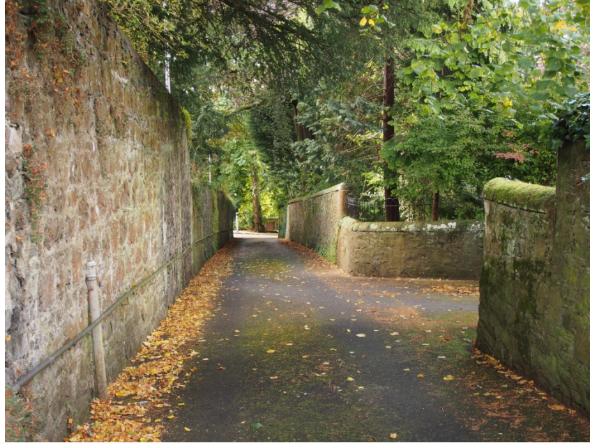
Fig.10. View looking down Bowerswell Lane to its junction with Bowerswell Road