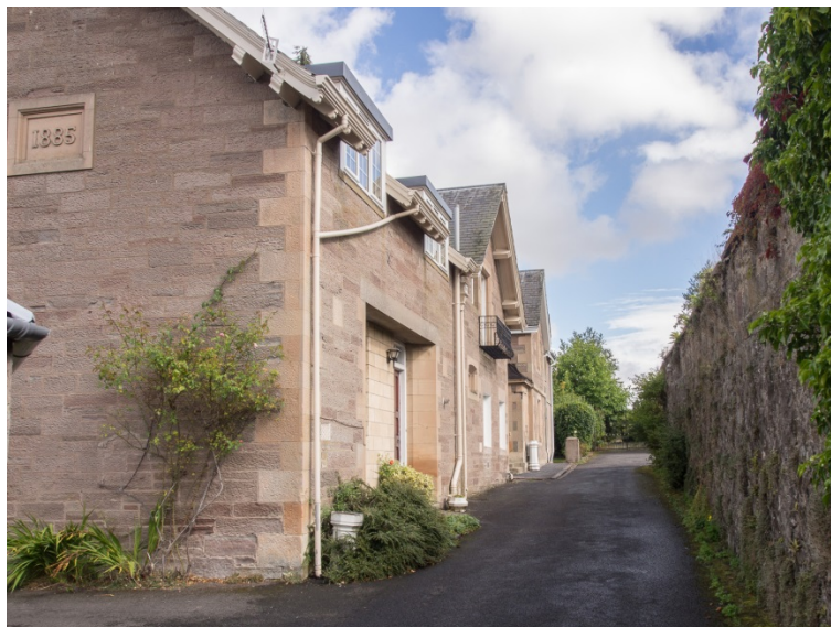
Fig. 9. View looking up Bowerswell Lane (Cottage would have been just to the left at the end of the lane)