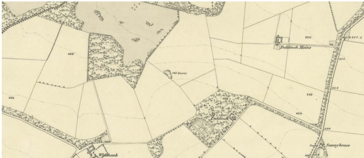
Fig.3. Ordnance Survey Map showing Feddinch, Cameron Parish, Fife