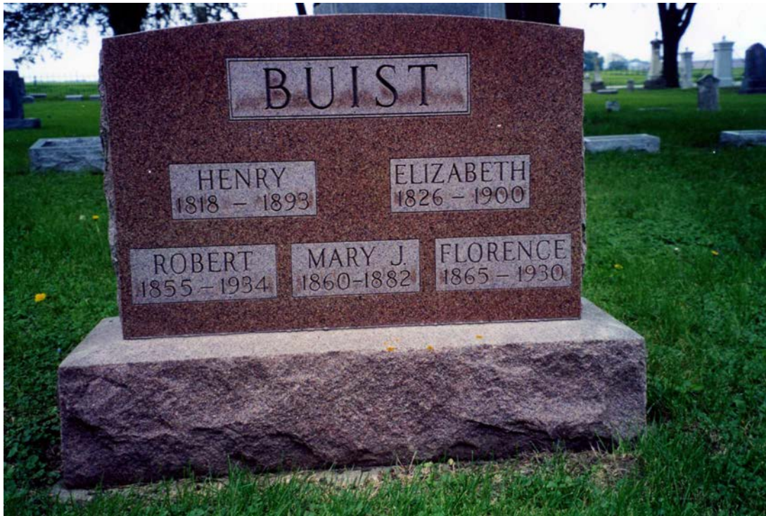
Fig.12. Buist Family Graves at Odebolt Cemetery, Odebolt, Iowa