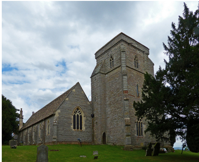
Fig.7. St. Mary the Virgin Church, Forthampton Parish, Gloucester, England