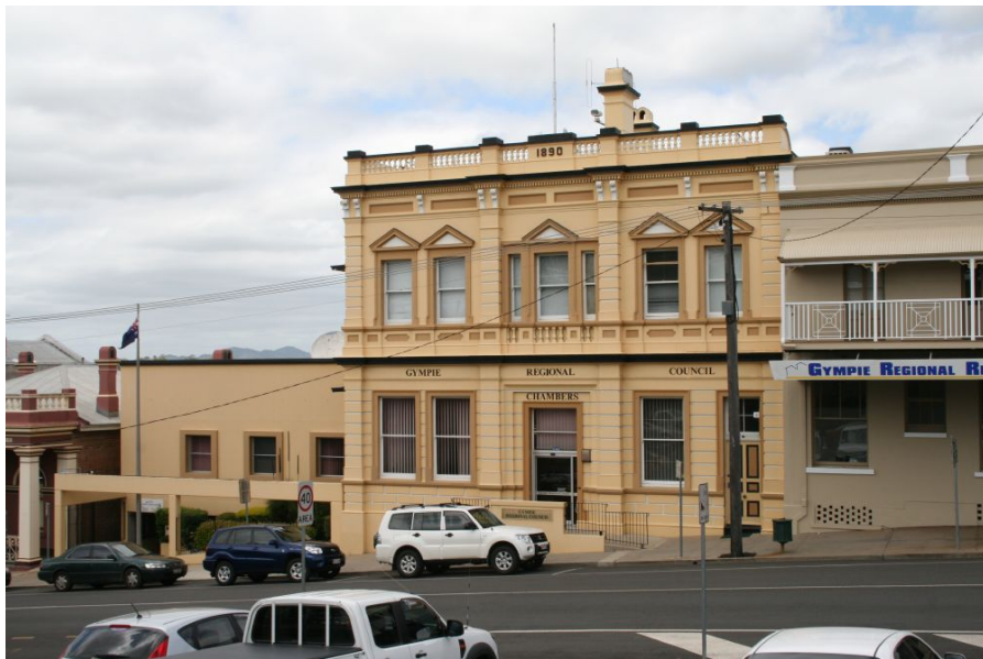
Fig.11. Widgee Shire Council Chambers, Gympie, Australia