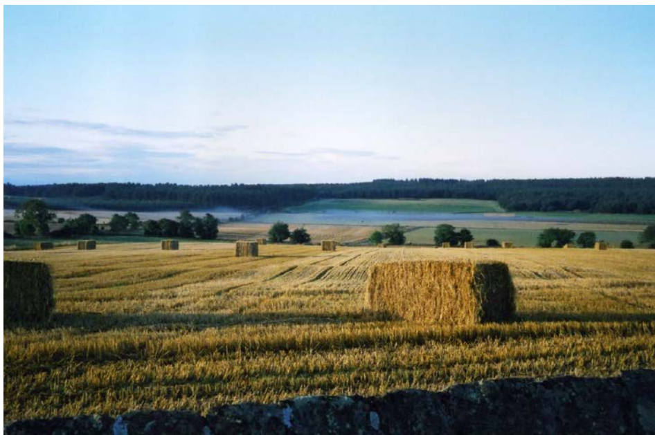
Fig.3. The Farm Fields of Rameldry, Kettle Parish, Fife, Scotland

He grew up on the ancestral farm of Rameldry where he learned how to farm with his father who lead a long and distinguished life while at Rameldry.