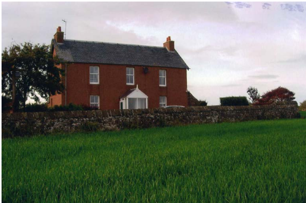
Fig.6. Rameldry, Kettle Parish, Fife