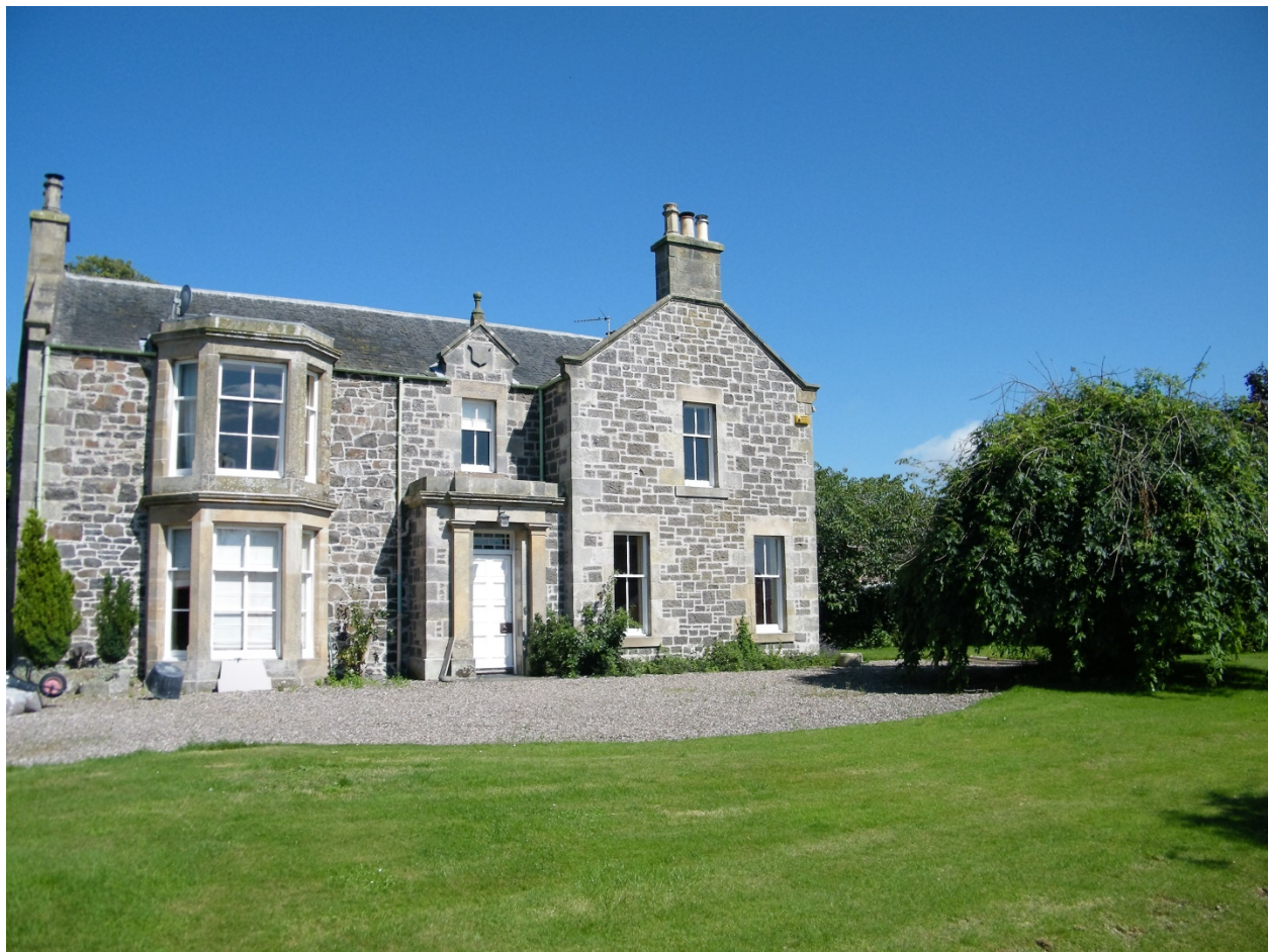
Fig.17. Dunbog House, Dunbog Parish, Fife