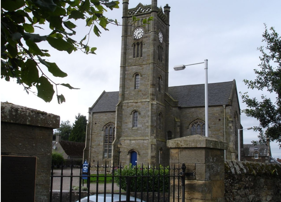
Fig.2. Kettle Parish Church, Kingskettle, Fife, Scotland

He grew up on the ancestral farm of Rameldry where he learned how to farm with his father who lead a long and distinguished life while at Rameldry.