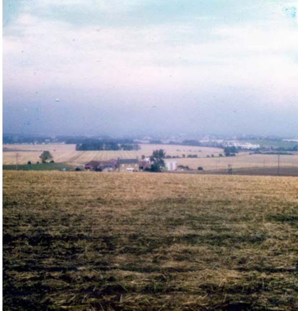
Fig.4. View of Feddinch Estate, taken in 1979