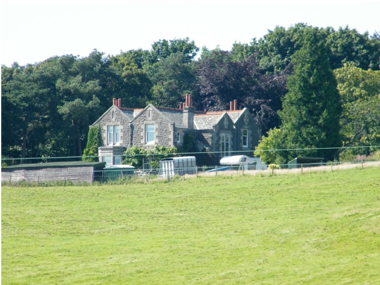
Fig.9. Higham, Dunbog, Fife, Scotland, Photograph Courtesy of Mrs. Frances Black