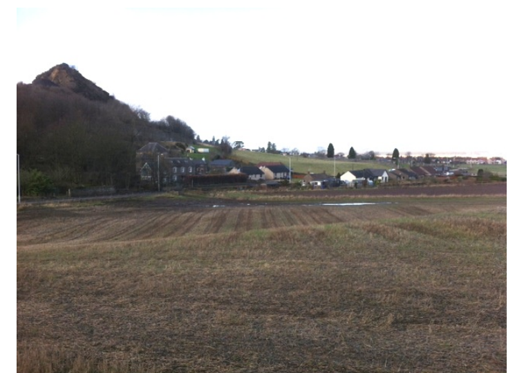
Fig. 5. Craigmill from a distance, Abdie, Fife, Photograph Courtesy of Mrs. Frances Black, Fife Family History Society, 2014